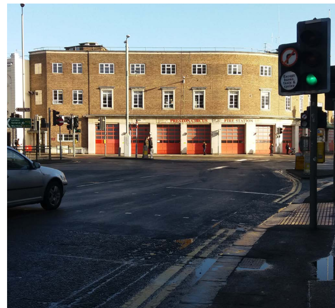
Preston Circus Fire Station, Brighton

Patcham Court Farm, Brighton. This project sees Brighton & Hove City Council, the asset owner, facilitating the redevelopment of a vacant three-and-a-half-acre site formerly part of the wider landholding of Patcham Court but becoming physically divided from its associated farmland in the late 1980s/early 1990s following the development of the A27 bypass. The site has not been developed since that time, despite numerous attempts to bring it forward. The Council is now at an advanced stage of negotiations with its preferred partner, the Royal Mail Group. Due diligence (surveys, pre-planning reviews and pricing) is being completed and dependent on the outcome of this work, it is anticipated that a subject to planning proposal for