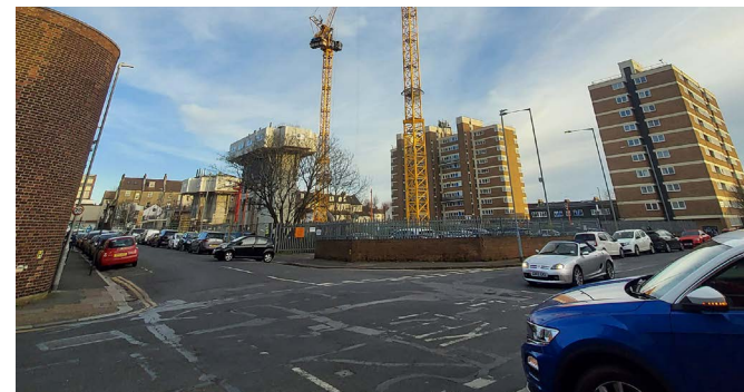
Hove Station Area