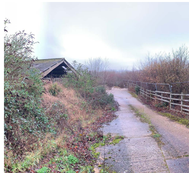
Patcham Court Farm, Brighton