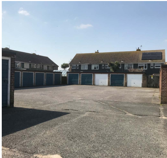
St Giles Close

Land Release Fund funding is supporting the council to deliver 6 of these sites. The sites comprise out-of-date garages, some in a serious state of dilapidation and many used for storage as they are too small for modern cars. The sites are underutilised and uninviting and are subject to antisocial behaviour, including fly-tipping. The programme will regenerate these sites, creating 33 new council homes for rent and improved landscaping for wider public use.