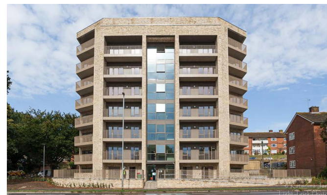
Selsfield Drive 2021, Brighton