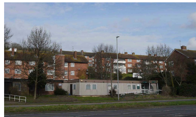
Selsfield Drive 2018, Brighton