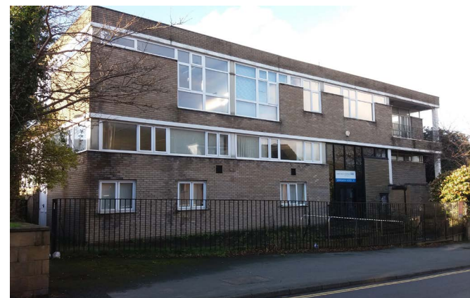
Springman House, Lewes

Kensington Street and Selsfield Drive, Brighton. These projects were successfully completed by Brighton & Hove City Council's New Homes for Neighbourhoods Programme in 2019 and 2020 respectively, with the support of Land Release Fund funding. Kensington Street saw the redevelopment of 3 former car parking sites in the central North Laine area of the city to deliver 12 new homes, while Selsfield Drive regenerated the site of a former Housing Office to create 30 new homes. The 42 homes are all occupied by tenants from the council's housing register.